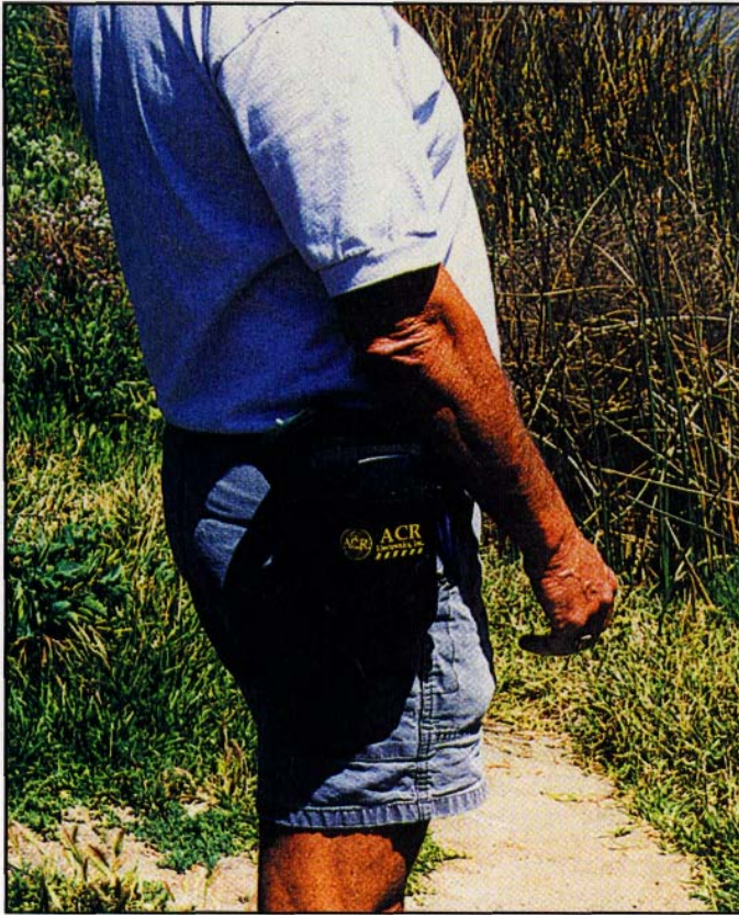
PLBs are small enough to wear, but they must be placed out in the open to signal satellites.