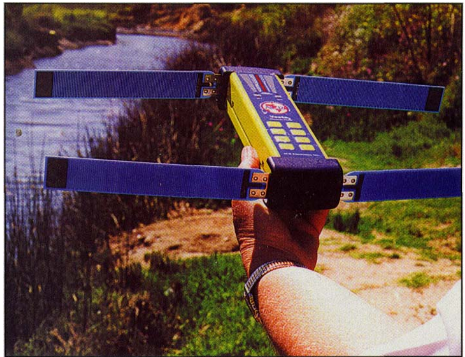
The ACR Direction Finder in a real 121.5-MHz track-down along a popular river rafting route in a remote area.

MHz, 25-milliwatt locating signal for ground units is constantly tugging on battery capacity.