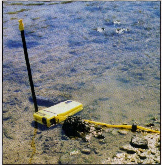
The test signal on 121.775 was increased by 3 dB by placing the test PLB on a water groundplane.

mail, and a telephone number to someone LIVE—not an answering machine—that can tell rescue agencies that you are indeed out on a hiking trip in the High Sierras.